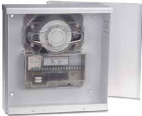
WP-1 RW/SM Series detector not included

The WP-1 enclosure provides protection for the RW and SM Series duct smoke detectors. These enclosures offer outdoor protection from rain, sleet and snow, or indoor protection from dripping water.