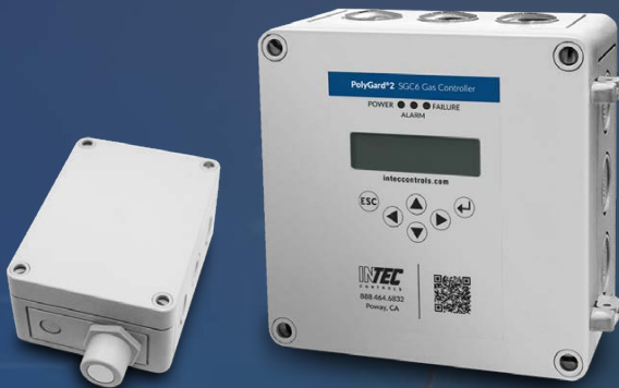
SGC6 + DR6 Series Commercial Applications

These field-proven units feature a standard 4-20 mA analog output and two relays with adjustable switching thresholds. Our hydrogen monitoring solutions are feature-rich, with warning capabilities to promptly alert personnel to dangerous gases.